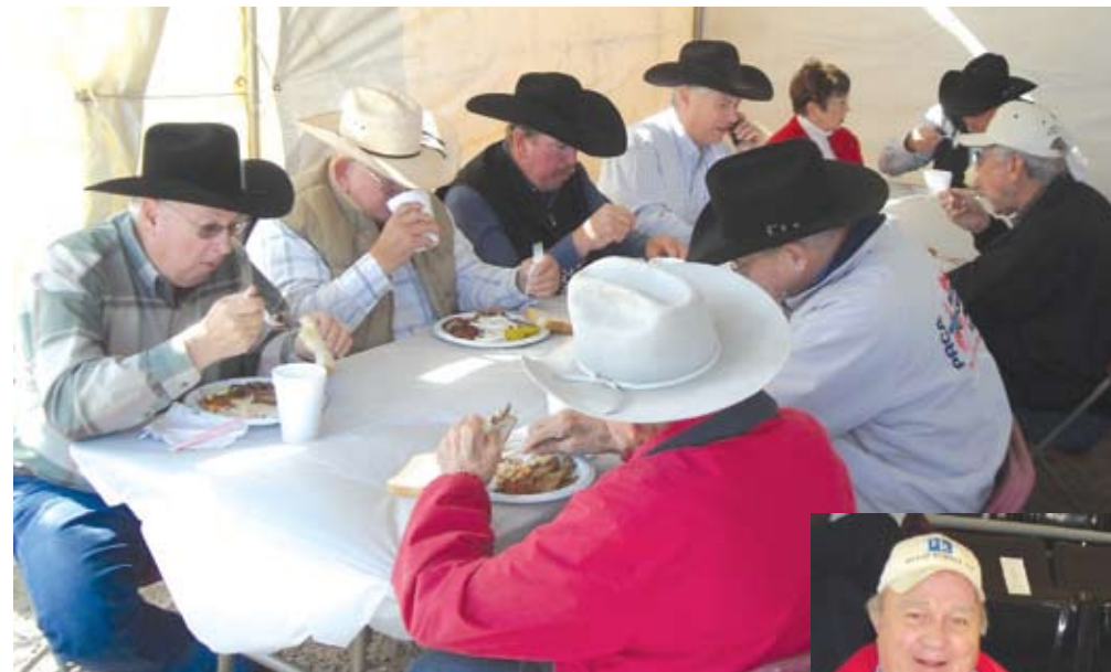
Some more of the tent crowd ...