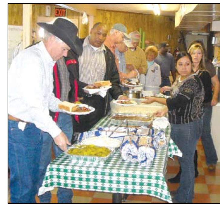
NETBIO Sale folks enjoy a BBQ meal served up by the ladies in the Sulphur Springs Livestock Café.

The NETBIO Board of Directors decided after the success of the sale to keep it on the market schedule for 2011.