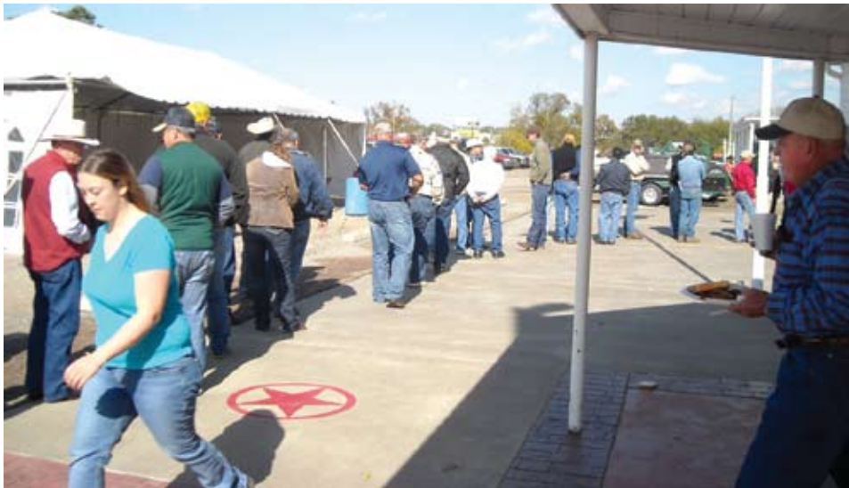
Heading for the BBQ lunch line ...