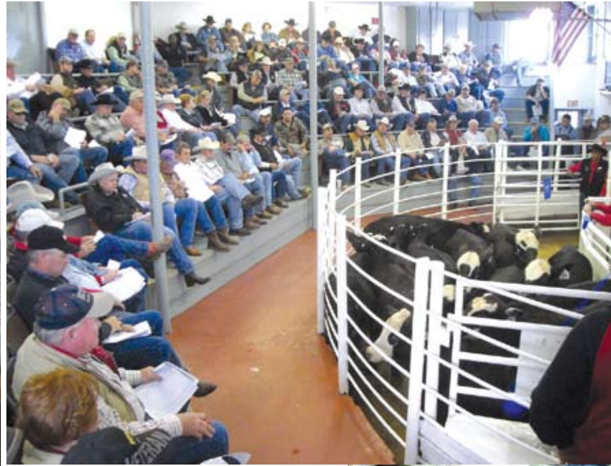
Interest was high in all lots of cattle sold at the November NETBIO Sale.