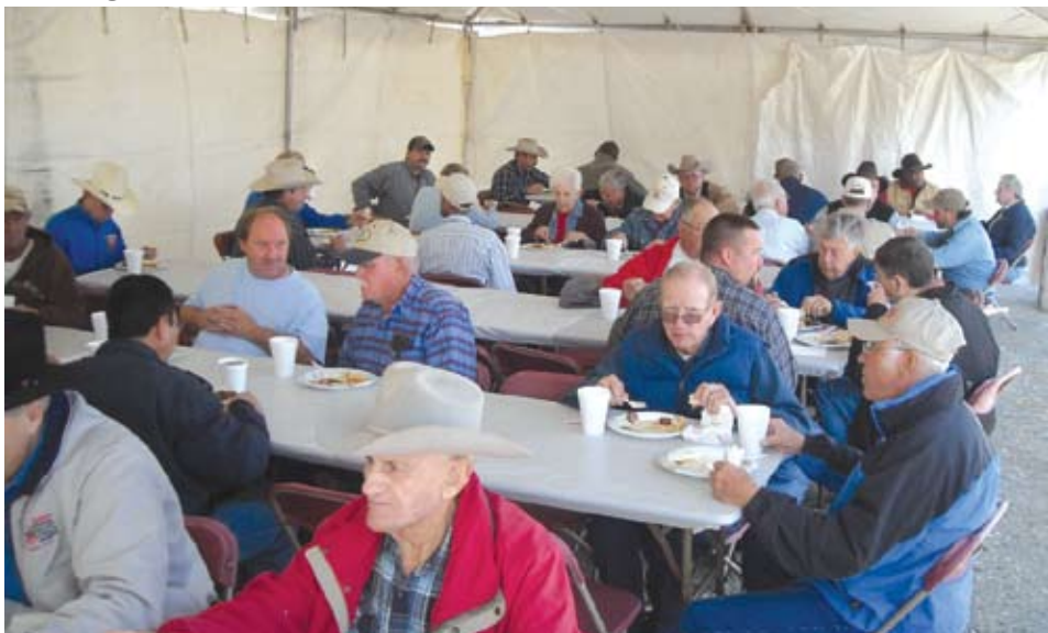
Everyone enjoyed eating under the tent and visiting.