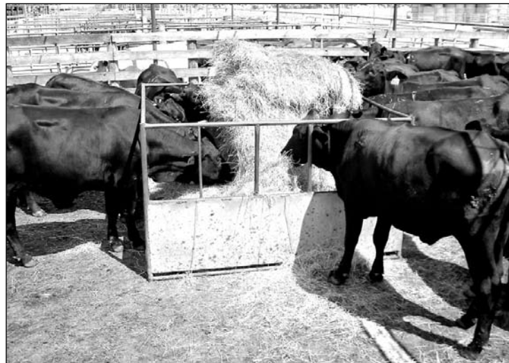
Keeping the cattle fed before and during the sale.