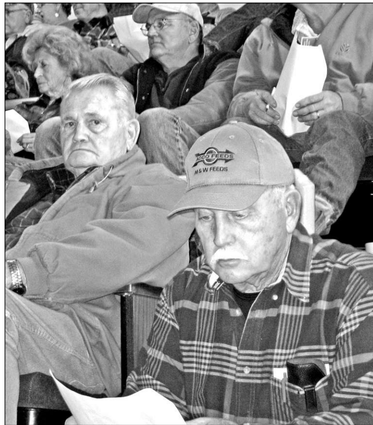
Studying the sales sheet . . .